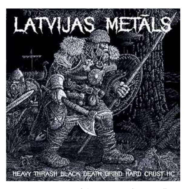
Figure 9. Latvijas metāls (Latvian Metal) music album cover illustration by Māris Āboliņš [lsm.lv kultūras redakcija 2015].

Another interesting example of the way how contemporary art influences and teaches the past is the huge popularity of folk metal music [Skyforger; Varang Nord etc.] in Latvia. These bands always use strong iconography with replicas of archaeological costumes, merchandise and album covers with archaeological themes. For example, the cover illustration by Māris Āboliņš of music album Latvijas metāls ("Latvian Metal") (fig. 9) shows oddly exaggerated warrior figures wearing a lot of