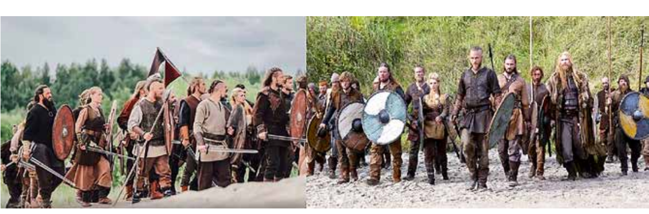
Figure 8. Semigallians from The Pagan King, initially The King's Ring ( Nameja gredzens , 2018) (on the left) [DELFI 2017], and Vikings from Vikings TV (2013 to present) series [ Vikings (2013 TV series) 2014].

Another interesting example of the way how contemporary art influences and teaches the past is the huge popularity of folk metal music [Skyforger; Varang Nord etc.] in Latvia. These bands always use strong iconography with replicas of archaeological costumes, merchandise and album covers with archaeological themes. For example, the cover illustration by Māris Āboliņš of music album Latvijas metāls ("Latvian Metal") (fig. 9) shows oddly exaggerated warrior figures wearing a lot of