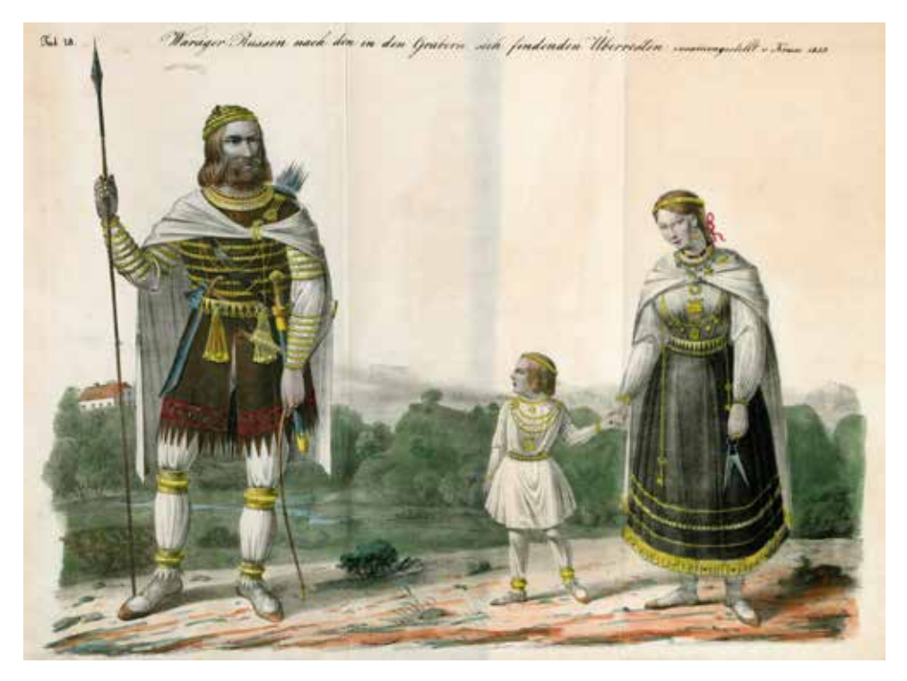
Figure 1. The first known attempt to depict the inhabitants of territory of Latvia, based on archaeological material (original title: Waräger-Russen nach den Grabern sich findenden Uberresten zusammengestelt ) by Friedrich Karl Hermann von Kruse (1790–1866) [Kruse 1842: Tab. 78].

The first known amateur-scientific attempt to depict the Late Iron Age inhabitants of the territory of Latvia, based on archaeological material, was made by Friedrich Karl Hermann von Kruse (1790–1866) already in 1839 [Kruse 1842: Tab. 78] (fig. 1). The reconstruction (or interpretation) of the appearance of a man, woman and child was based on archaeological artefacts that were found along the river bank after a big flood. The lack of burial context led to many – as we now know – wrong assumptions and heavily distorted the general look of ancient people. For example, man can be seen wearing a lot of jewellery pertaining to women, he has bracelets on his knees and ankles, and the child is wearing a neckring as a belt, etc.