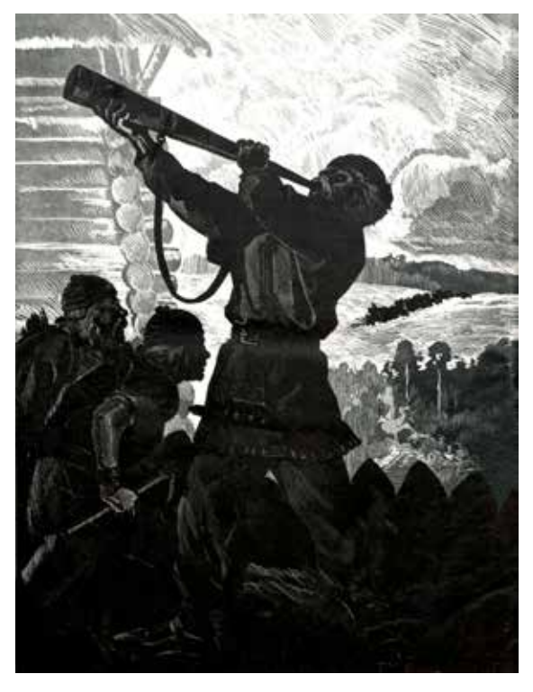
Figure 6. Graphic drawing by Kārlis Krauze (1904–1942) – Ancient Latvian trumpeter ( Senlatvju taurētājs ) [Krauze 1932: 32].