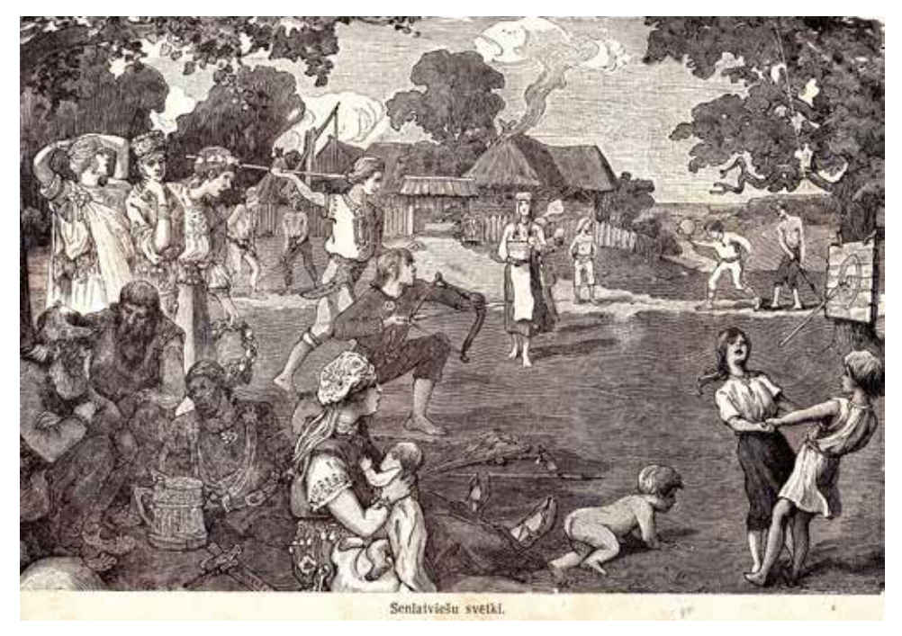
Figure 3. Feast of Ancient Latvians ( Senlatviešu svētki ). Illustration from school history book [Paegle 1924: 80].

32] (fig. 6) and even in his diploma work at the Academy of Art – Latvieši atstāj Tērveti ("Latvians leave Tērvete") [Krauze 1932: 25].