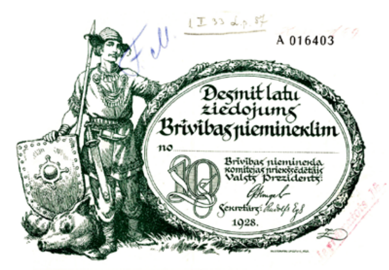
Figure 7. Donation token (1928) for National Freedom Monument ( Brīvības piemineklis ). Graphic work by Rihards Zariņš (1869–1939) [Ziedojumu karte. 1928. gads. LNA LVVA, 1303. f., 4. apr., 5. l., 210. lp.].