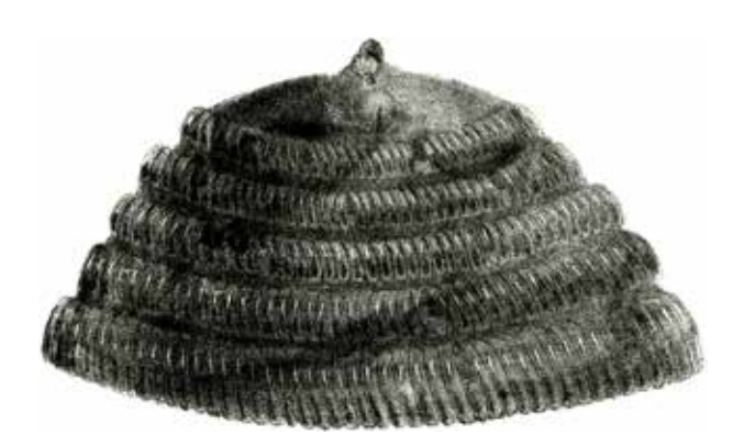
Figure 2. The reconstruction of "warrior's helmet" by Kruse [Kruse 1842: Tab. 19, No. 1].

When considering the lasting influence of visual information, in this case we must stick to one particular detail. The man is wearing a helmet-like thing on his head, actually consisting of several different artefacts put together, and basically a head ornament usually worn by women. Kruse, based on then-dominant Norman theory, thought that he had found the remains of some Rus people, although they were actually belonging to Latvian tribes (11<sup>th</sup> –12<sup>th</sup> century AD). However, after this unfortunate reconstruction (fig. 2) we see the same "helmet" appearing again and again in future artists' works as well as in publications purporting to show a specific armament component characteristic to Latvian warriors [LNVM 2017]. Despite the inaccuracies, this very image has left indelible traces in the cultural history of Latvia, so the National History Museum of Latvia has preserved this artefact as a historical witness.