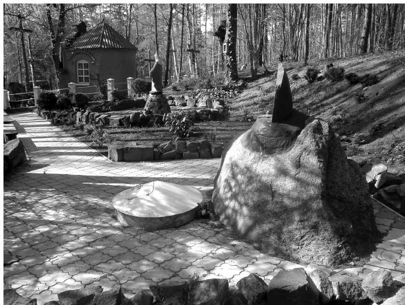
Fig. 1. The Eršketynė natural holy place in the vicinity of Darbėnai (Kretinga District). The holy stone has already been transformed into a base for a granite plaque with Christian symbols carved in it. Moreover, all the Christian elements (buildings, figurines and structures) contradict the concept of the naturalness of natural holy places.

In conclusion, it should be stressed that nature and natural are absolutely normal characteristics of the Balts' holy places, both with regard to the surrounding space and character of the place itself. The term natural holy place is relevant when dealing with the Balts' holy places and discussing them in English.