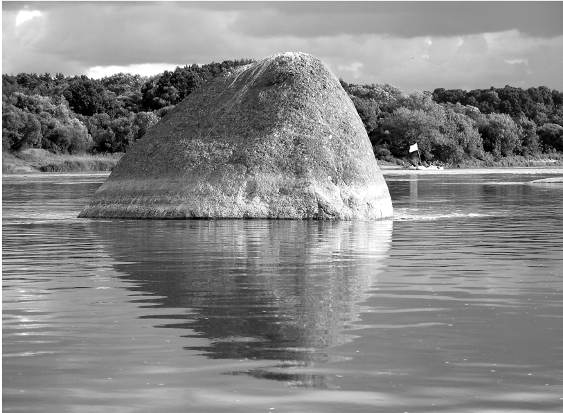
Fig. 2. The Rooster's Stone (Gaidelis) near Krėslynai village (Jonava District) – the largest boulder in the River Neris. Place legends indicate the sacred significance of the site.

water. Annual festivals connected with the River Neris used to cover almost the whole annual cycle.