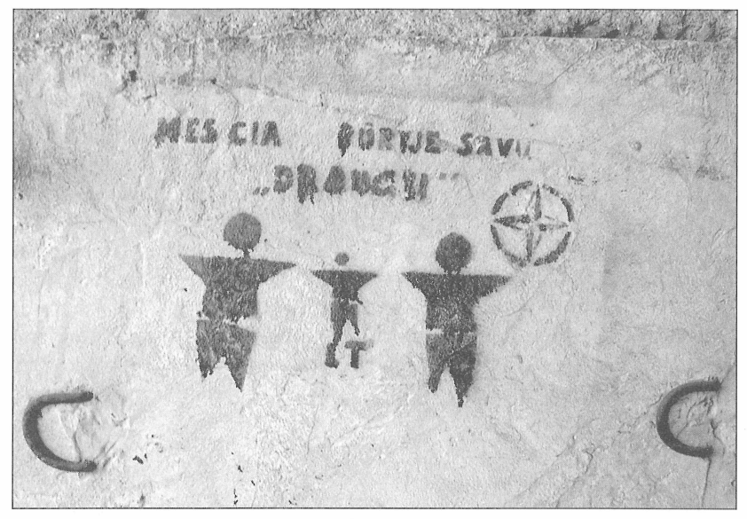
Fig. 4. Stencil "Mes čia būryje savų draugų" ["Here we are amongst our own "friends""], with NATO icon. Kaunas, 2005.

4. att. Trafaretu māksla Mēs starp "draugiem", ar NATO logo. Kauņa, 2005.