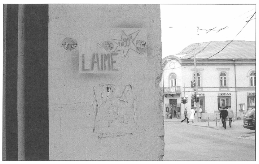
Fig. 5. Stencil "Laimė tik 99,99" ["Happiness – only 99,99"]. Vilnius, 2006. 5. att. Trafaretu māksla Laime tikai 99,99. Viļņa, 2006.

al values, originality and self-consciousness. Stencils critical of society could be treated as a response or as a mirror to society, reflecting subculture youth activities.