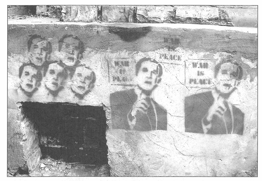
Fig. 3. The stencil "War is Peace" with an image of George Bush. Panevėžys, 2006. 3. att. Trafaretu māksla Karš ir miers, ar Dž.Buša attēlu. Paņeveža, 2006.

activists seek equal human rights on the economic level, a struggle against the exploitation of poorer countries, and are against the social and political hierarchy. Politics in the USA are especially in focus: "Drop Bush not Bombs", "War is peace" (pic.3).