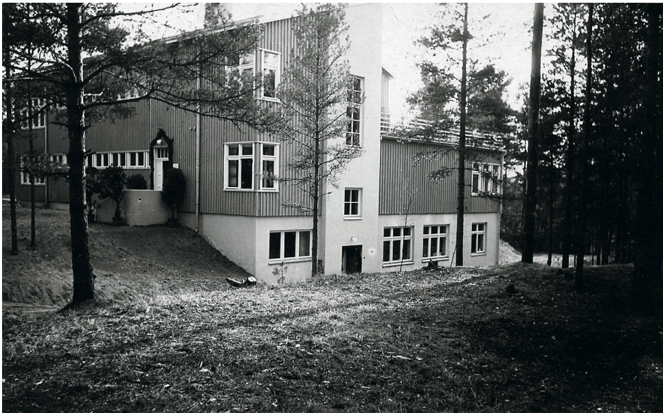
Figure 5. Ernests Štālbergs. Sanatorium Gaujaslīči . 1936–1939. View from the north.

A similar connection with nature is demonstrated in children's sanatorium Gaujaslīči whose architectural expression is based on the relief as well as on natural and modest finish materials (Figure 5). The building's façades are clad with vertical boards that create an aesthetic effect based on rhythmical lights and darks, also giving a modernist interpretation of the surrounding wooden cottages. However, one can widen the scope of analogies and influences, as such exterior finish was very common in exemplary houses at the Stockholm Exhibition, modernising the archetype of traditional Swedish farmstead. The sanatorium was possibly a synthesis of impulses from several such houses, evidenced not just by the vertical board cladding but also by the use of the single-pitched roof, close window proportions and rhythm. Similar examples were house no. 49 designed by Sven Markelius and house no. 47 by Sigurd Lewerentz. Štālbergs also took photos of simple, similarly boarded one-family houses during his visit to Sweden in 1934 [Štālbergs 1934]. The sanatorium complex was created, purposefully using the natural light, relief and pine forest conditions. The building conformed to the right-angle aesthetics but it was more adapted to human needs and emphasised naturalness, directly revealing the regional specificity of Northern European functionalism.