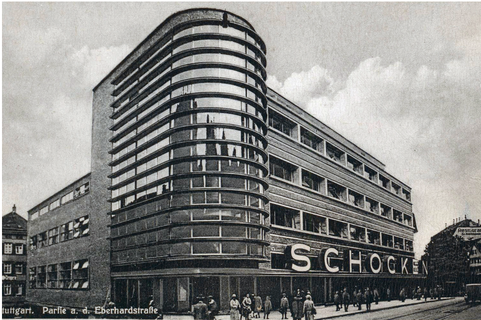
Figure 2. Erich Mendelsohn. Schocken Department Store in Stuttgart. 1926–1928. Postcard, 1930.

Influences from Mendelsohn remained persuasive later too. Reconstruction design of Hotel de Rome in Riga was worked out in summer 1930. Štālbergs here proposed a bold solution, breaking the uniform rhythm of the 19 th century neo-renaissance façade with a remarkably modernist element – a narrow, vertical, fully glassed semicircular bay window (Figure 3). A similar principle was used for the reconstruction of the newspaper Berliner Tageblatt administrative building in Berlin by Erich Mendelsohn and his assistant Richard Neutra in 1921–1923. They put a new, contrasting modernist structure on the historicist Art Nouveau building, creating a streamlined corner [Krohn, Stavagna 2022: 58]. Štālbergs turned the 19 th century historicist building into a shell for the modern content and lifestyle, manifested by the sharply contrasting glass split on the façade. The architect's clear shift towards modernism is seen in the concept of reconstruction, aimed at a deliberate contrast between the new structure and the historical architecture. The striking difference between the old and the new emerges as a surprisingly progressive idea in Latvia's architectural milieu of the time.