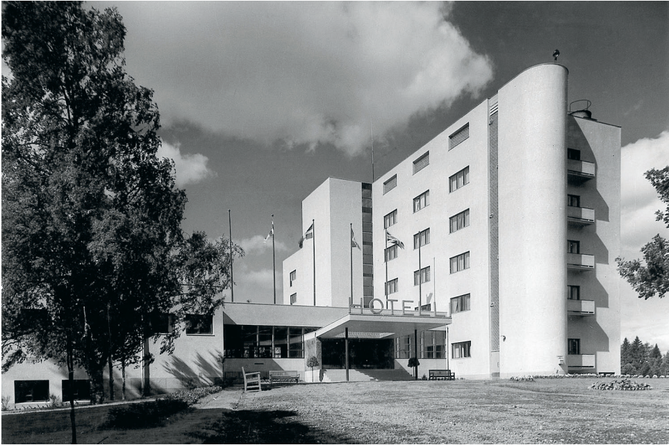
Figure 7. Märta Blomstedt, Matti Lampén. Hotel Aulanko in Hämeenlinna. 1936–1939.