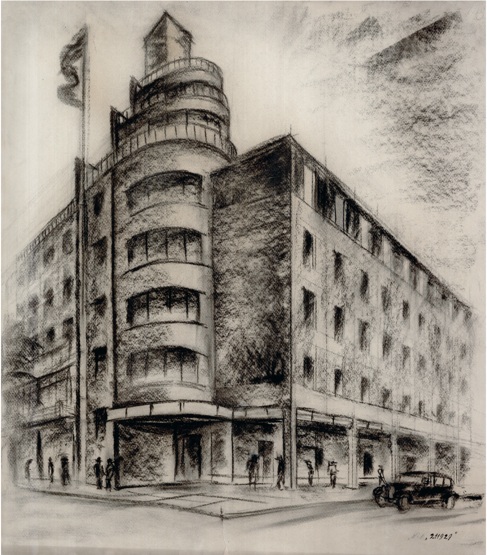
Figure 1. Ernests Štālbergs. People's House in Riga. Third design version (competition design). 1928–1929. Perspective. Latvian State Archive, coll. 95, reg. 1, file 139, p. 19.

Direct influences suggest that he possibly saw the building in person, as during his 1928 research trip to Germany [Štālbergs 1928] the architect prepared for the work on his Riga municipal building project and could visit the exemplary Weissenhof Estate 1 in Stuttgart for this purpose.