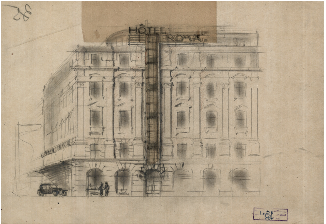
Figure 3. Ernests Štālbergs. Hotel de Rome reconstruction design. 1930. Perspectival view from Aspazijas Boulevard. Latvian State Archive, coll. 95, reg. 1, file 233, p. 35.

In the early 1930s, the line of influence from Le Corbusier became stronger in Štālbergs' output, especially evident in his dwelling house designs, including architectural volumes as well as floor plans and interiors. Štālbergs examined and interpreted Le Corbusier's works to master the formal language of modernism. For example, in a sketch of an unknown mansion, Štālbergs tried the French architect's five principles of modernist architecture – the building had a flat roof, band-type windows on the façade but the ground floor was envisaged with a covered, post-supported gallery with large, shop-like windows, creating a visual impression of a volume resting on posts above the ground [Štālbergs ca. 1930–1931]. The sketch reveals influences from Le Corbusier's most typical works of the second half of the 1920s – semi-detached house at Weissenhof Estate (1926–1927) in Stuttgart and Villa Savoye (1928–1931) in Poissy. Štālbergs returned to this typical modernist façade composition in his 1934 competition design of Liepāja Latvian Society House – the main façade facing Rožu Square (Figure 4) is compositionally close to Le Corbusier's classic Villa Savoye. Direct impulses from Le Corbusier are also evident in the engineer Aleksandrs Siksnā's house with its two-level, multi-functional