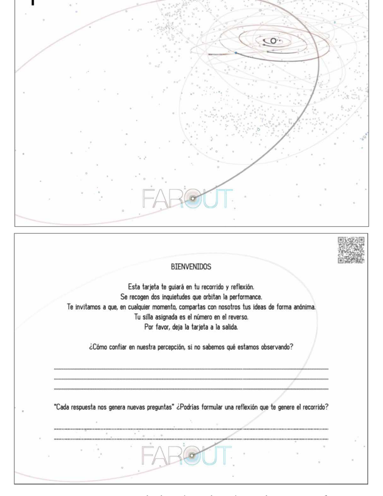
Figure 1. Participatory cards distributed to the audience in Telescope II .