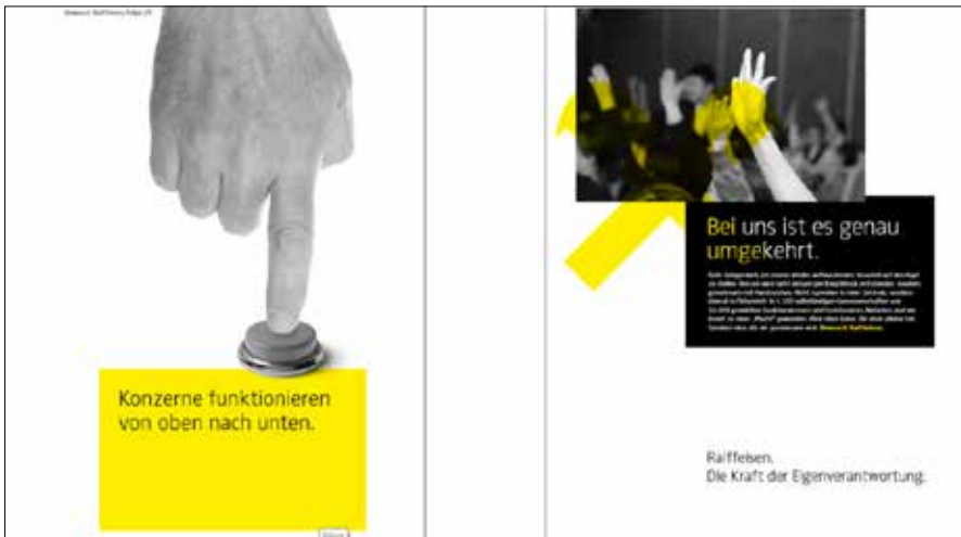
Figure 5. “Consciously Raiffeisen” subject. Raiffeisen Zeitung No. 20, Thursday, May 18, 2017; Austrian Raiffeisen Association.