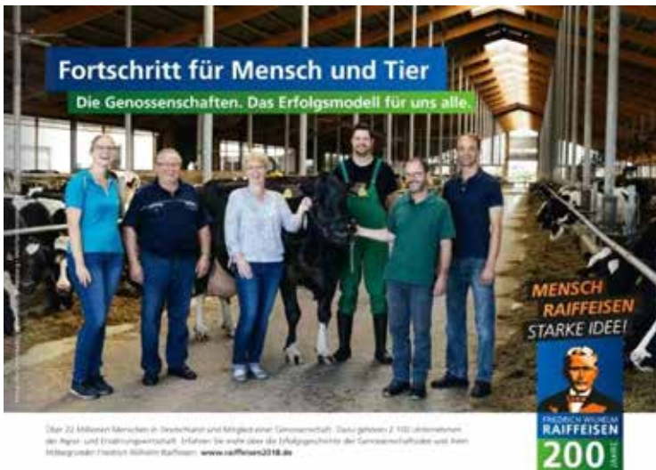
Figure 3. Poster motif of the German Raiffeisen Association for the Raiffeisen Year 2018.

The key visual was rolled out at the beginning of the Raiffeisen Year in all three associations (the German Raiffeisen Association (DRV), the National Association of German Cooperative Banks (BVR) and the Genossenschaftsverband – Verband der Regionen (Cooperative Association – Association of Regions)). All cooperatives were responsible for its use on a voluntary basis. The German Raiffeisen Association developed its own campaign in addition to the key visual.