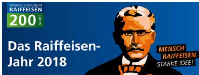
Figure 2. Key Visual of German Campaign.

With the chosen motif, the founding father of the cooperative idea, Friedrich Wilhelm Raiffeisen, is placed in the centre of the campaign. As provider and “head” of the idea, the focus is on the “Man Raiffeisen” with all his (graphic) facets. In addition to the central content such as “Raiffeisen Year 2018” and “200 Years”, the campaign motto is “The Man Raiffeisen. Great Idea!”. The colour code blue, orange and green is based on the traditional colours of the German cooperative banking sector (Volksbanks and Raiffeisen banks, blue and orange) and the agricultural