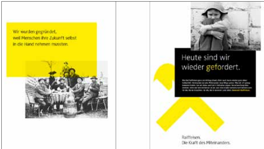
Figure 4. “Consciously Raiffeisen” subject. Raiffeisen Zeitung No. 43, October 22, 2015; Austrian Raiffeisen Association.

The central colour code consists of the three main colours of the Austrian Raiffeisen Association: green, yellow and black. White is added as a contrasting colour. The gable cross made of horse heads (in itself the logo of the Austrian Raiffeisen banks) is also used.