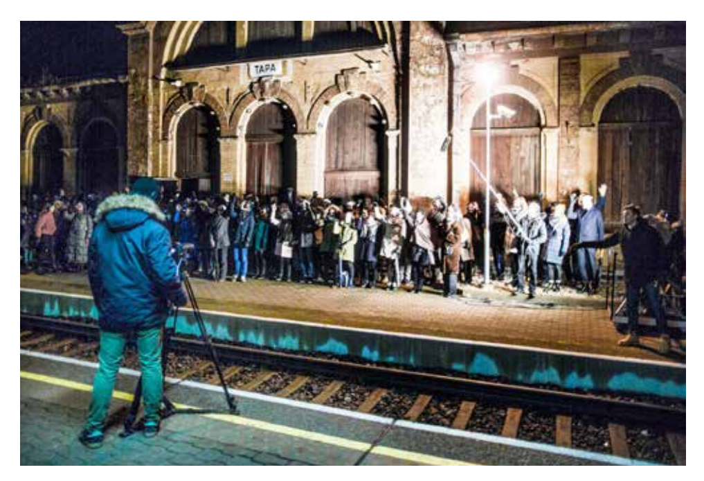
Figure 1. Audience members are filmed while they are waving at the arriving train in the style of the 1940s.

After listening to this dialogue between the film director and an amateur actor, the theatre visitors know why and whom they are waving at but keep doing it anyway. The waving has also a real-life effect when the theatre visitors from Tartu are asked to welcome the arriving train from Tallinn by waving at them and shouting hurray very cheerfully. The people from Tallinn are invited to join the group and the scene of waving and cheering is finally recorded by a real camera.